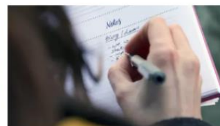
English and Drama