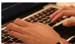
Computing and ICT