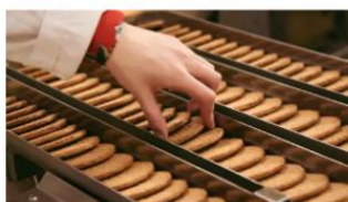
Food and nutrition