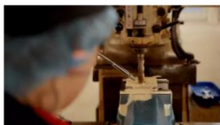
Design and technology