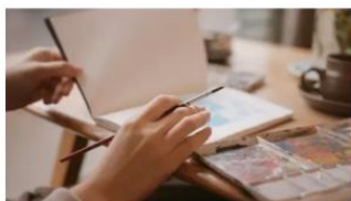
Art and design