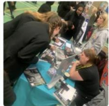
Blast from the past... Our 2015 Careers Event